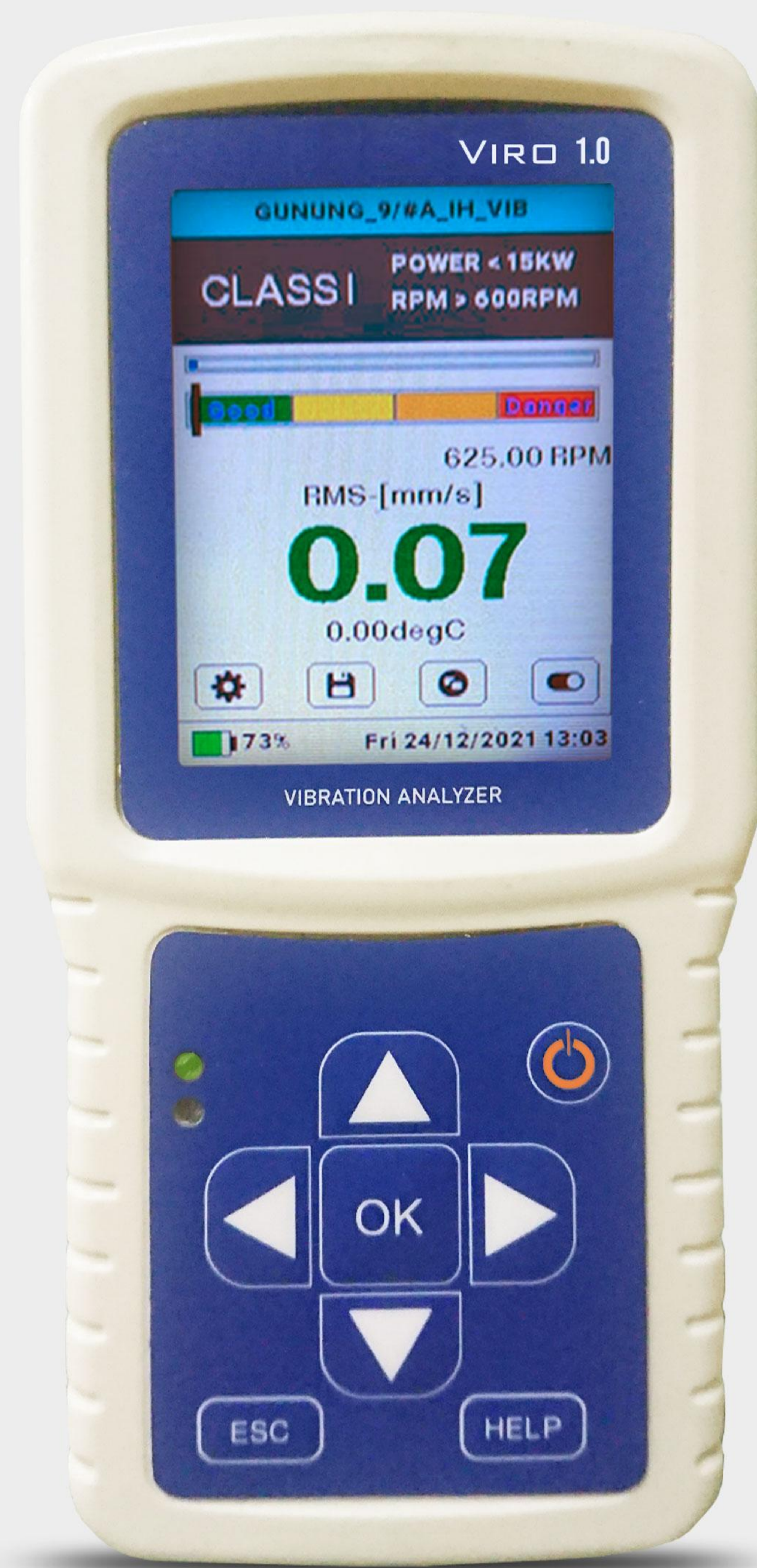
Vibration Data Logger